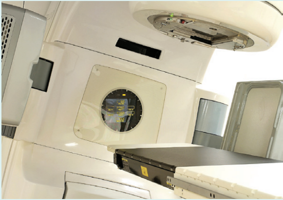
A linear accelerator is used to give radiation treatment.