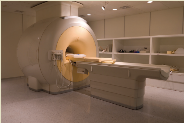
An MRI scanner

Usually an injection is given into a vein in your arm, and images are taken before and after the injection. This injection helps to highlight blood flow in the breast. This helps the radiologist decide if a change in the breast is cancerous or not.