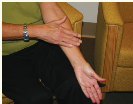
Fig 6. Apply moisturiser by stroking upwards.