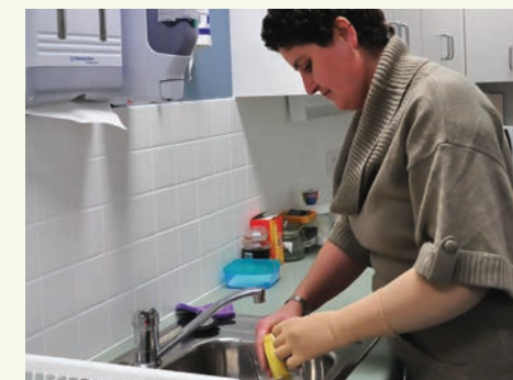
Fig 4. Using your arm as normally as possible is important.