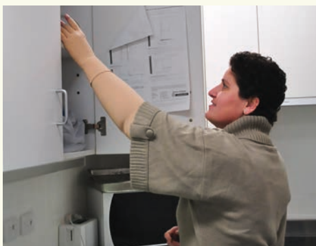
Fig 5. Using your arm as normally as possible is important.