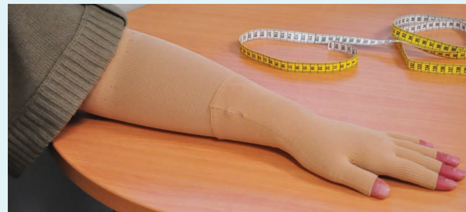
Fig 9. Compression garments can reduce swelling caused by lymphoedema.

There are exercise programs that help move extra fluid out of the affected arm. The exercises encourage fluid to clear first from the trunk and abdomen. Then they target the shoulder, arm and hand, to encourage the fluid to move out of