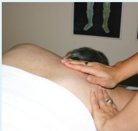
Fig 8. Massage techniques may help move fluid out of the arm.

a qualified lymphoedema therapist. A lymphoedema therapist is an occupational therapist, physiotherapist or nurse who is specially trained to treat lymphoedema. They can be found at www.nlpr.asn.au .