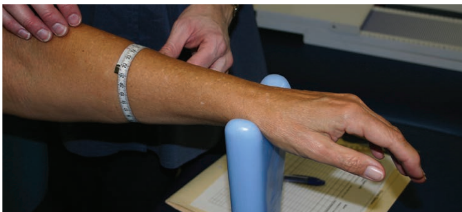
Fig 2. A lymphoedema therapist can measure your arm to see if you have lymphoedema.