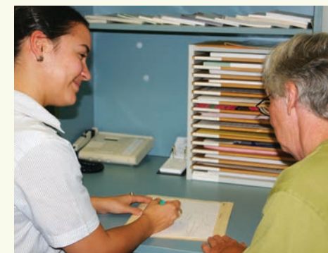
Fig 7. Learning to look after your arm is important when you have been treated for breast cancer.

to fly, speak to your lymphoedema therapist about things you can do to help your arm while flying. This can include wearing a compression sleeve and completing regular exercises.