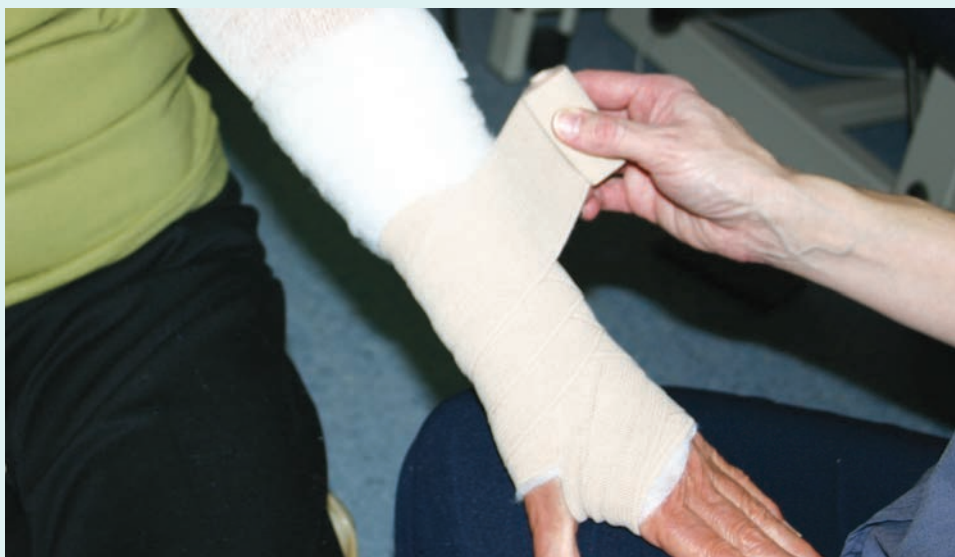
Fig 10. Bandaging the arm from the hand upwards has a similar effect to a compression garment.

the arm, and into the cleared trunk area. The exercises are gentle, and they are done each day. A lymphoedema therapist can teach you these exercises.