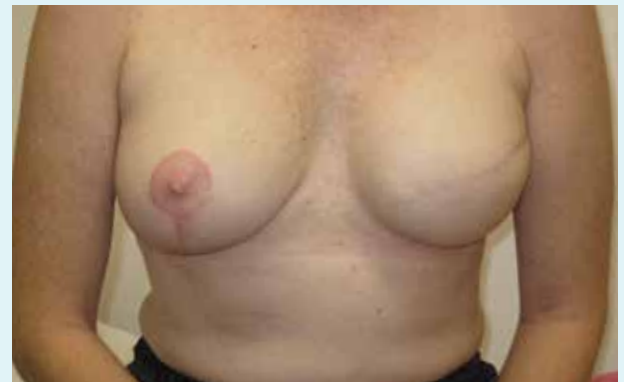
Figure 2: This woman had a left mastectomy and reconstruction using a tissue expander and a breast implant. She also had a breast lift on the right side to balance the breast size and shape. She has not undergone nipple reconstruction.

Sometimes tissue expansion is combined with some form of mesh to help create a more natural looking result.