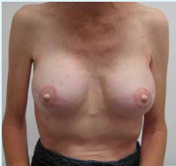
Figure 5: This woman had both breasts removed because she developed a cancer and also had a high genetic risk of breast cancer. She has undergone bilateral artificial 2-stage implant reconstruction and then underwent bilateral nipple reconstructions. She has had three operations over a 12-month period to achieve this result

Reconstruction of the nipple and areola is optional and is usually done as a separate procedure a later stage (when the swelling from the original operation has settled). There are a number of different surgical techniques that can be used to reconstruct the nipple and areola.