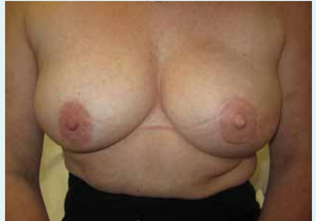
Figure 4: This woman has had a left skin sparing mastectomy and had a "free flap" reconstruction. She had a second operation to reconstruct the nipple areola complex + tattooing.