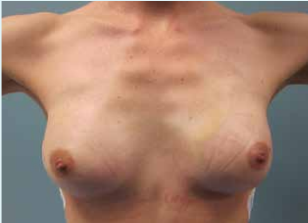
Figure 3: Bilateral nipple sparing mastectomy and direct-to-implant (single stage) reconstruction.

Flap reconstruction is not suitable for everyone. For example, women who are very thin may not have enough tissue on their abdomen to create a breast shape of the right size. Women who have had previous major abdominal surgery may also be unsuitable for this type of reconstruction. Because flap reconstruction requires healthy blood vessels, women who have diabetes, connective tissue disease, vascular disease,