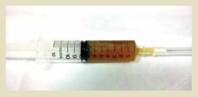
Cyst fluid can vary in colour and consistency. The most common appearance is a watery, 'straw-coloured' fluid, as shown above.