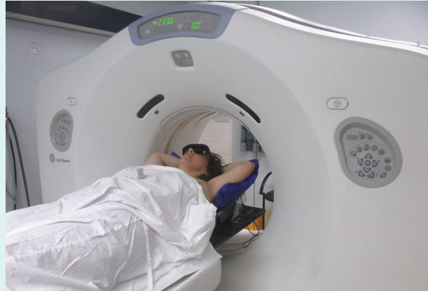
Planning of radiotherapy is done with the help of a simulator.

An extra treatment called a 'boost' may be given during or immediately following the treatment to your whole breast. It is given where the tumour started. Treatment normally takes 3 to 6 weeks.