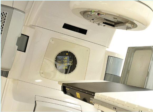
A linear accelerator is used to give radiation treatment.