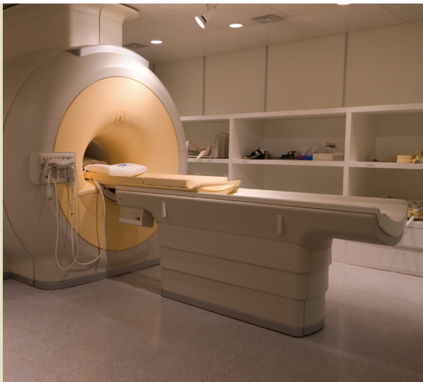
An MRI scanner

Usually an injection is given into a vein in your arm, and images are taken before and after the injection. This injection helps to highlight blood flow in the breast. This helps the radiologist decide if a change in the breast is cancerous or not.