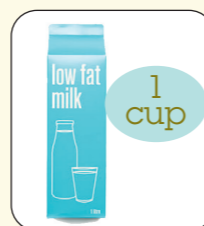
The pictures below illustrates a serve of dairy.